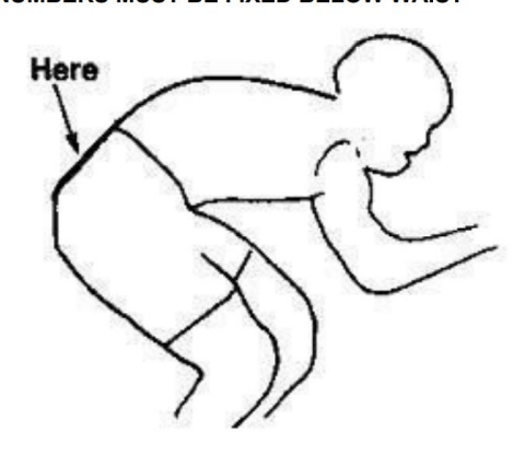
NO TIME MAY BE RECORDED IF NUMBER IS NOT CORRECTLY POSITIONED

CTT REGULATION: ALL RIDERS MUST START WITH BOTH A WORKING FRONT AND REAR LIGHT ATTACHED TO THEIR MACHINE